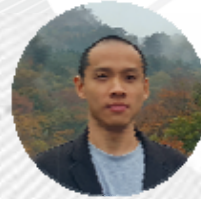
C L S o CTO